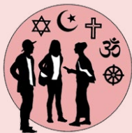
Illustration © Majsan Sundell

TRUE: Each individual has the right to freedom of religion or belief, and may not be subject to coercion by anyone – including leaders and other followers of their own religion or belief. Everyone – including leaders of religious or belief communities – has the right to state what they consider to be the right way to follow a particular religion or belief. The individual has the right to decide what they think of this, and to act on their decision.