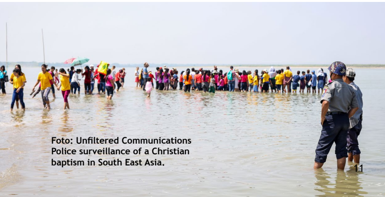
Police surveillance of a Christian baptism in South East Asia.

Other forms of conscientious objection are recognised by many states. These other forms of conscientious objection are the subjects of much debate, and include matters relating to healthcare (e.g. abortion and end of life care) and to same sex marriages. To understand how such issues are handled by the European Court of Human Rights we need to understand a legal term called the ‘margin of appreciation’. 13 The human rights system is based on States developing national systems of protection tailored to the country’s social, political and legal context, while international conventions and courts guarantee minimum standards for human rights. In order to respect the need for contextually appropriate protections, the European Court shows some flexibility in its judgements.