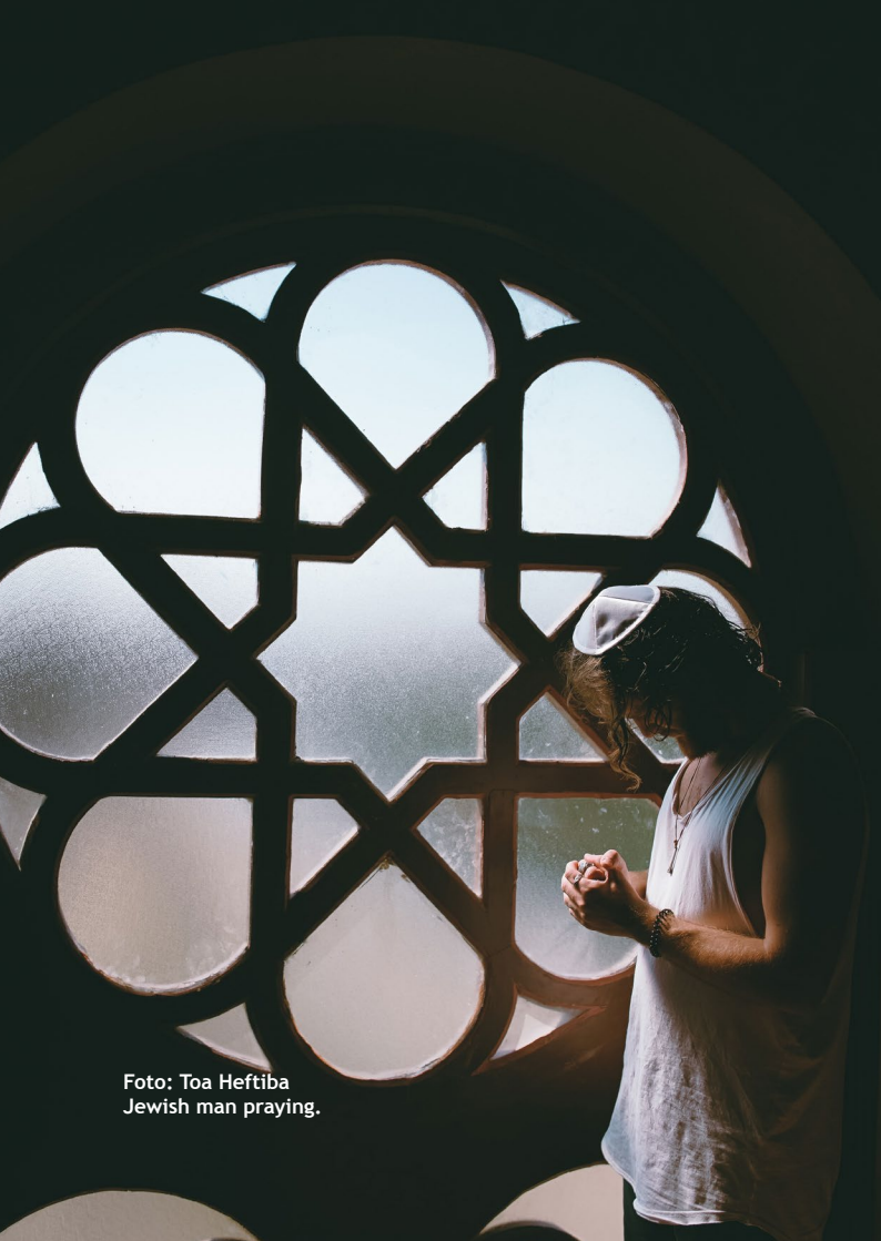
Jewish man praying.