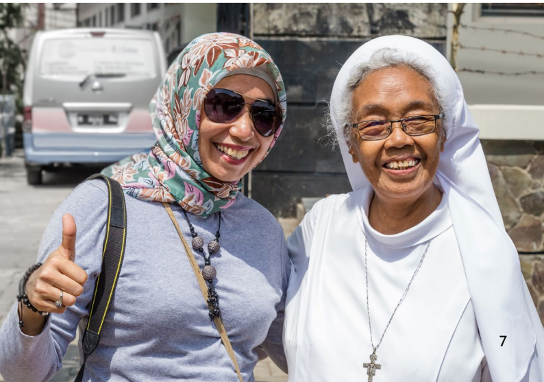
A muslim woman and a Catholic sister in Indonesia.

Over 80 percent of the world's population live in countries where the state places high or very high levels of limitations on freedom of religion or belief or where social tensions threaten people's ability to exercise the right. Minorities, freethinkers and those who criticise the state and religious institutions are most severely affected. 5